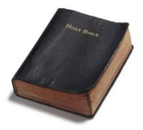
The Bible is the Word of God